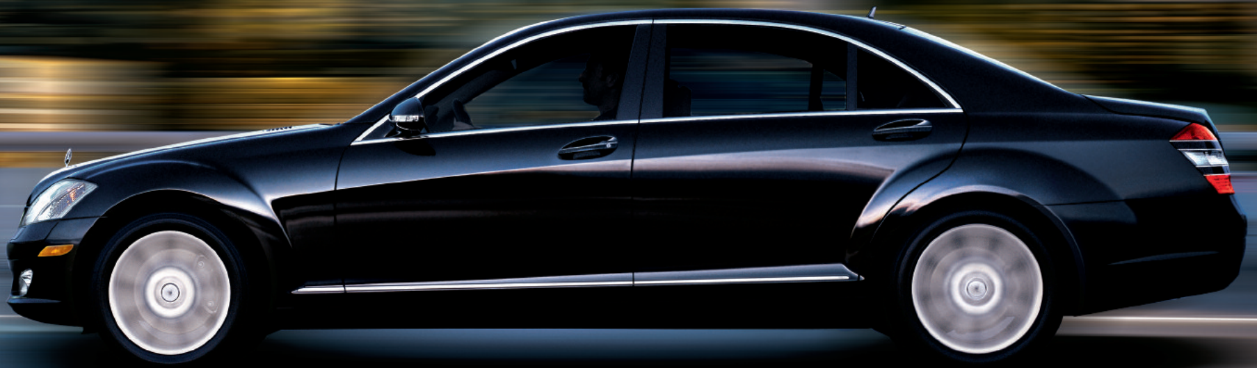
S550 shown in Black.