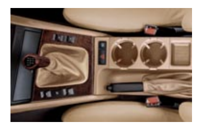
The close shift pattern of the six-speed manual transmission , standard in the 330Ci, delivers a precise, athletic feel for a more dynamic driving experience. (330Ci only)