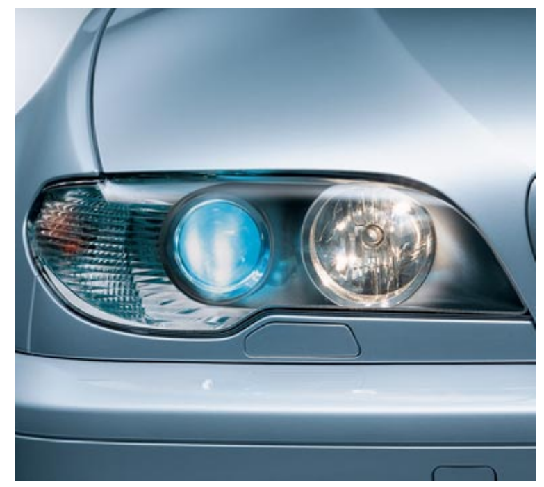
High-beam headlights illuminate the road ahead and to the side with brilliant clarity.