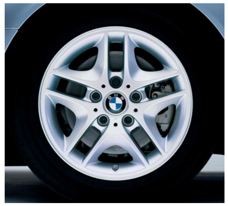
The 325Ci with 16 x 7.0 Five Spoke (Styling 88) alloy wheels and 205/55R-16 all-season tires.