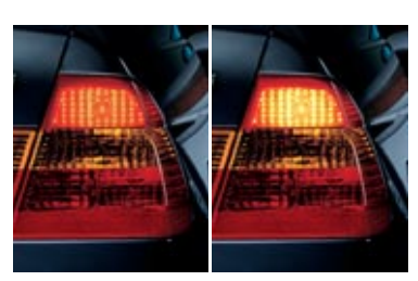
Adaptive Brake Lights increase vehicle visibility and signal the intensity of your braking action.