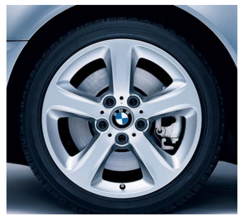
16 x 7.0 Star Spoke (Styling 45) alloy wheels and 205/55R-16 all-season tires work with Dynamic Stability Control to help maximize 325i and all-wheel drive 325xi traction.