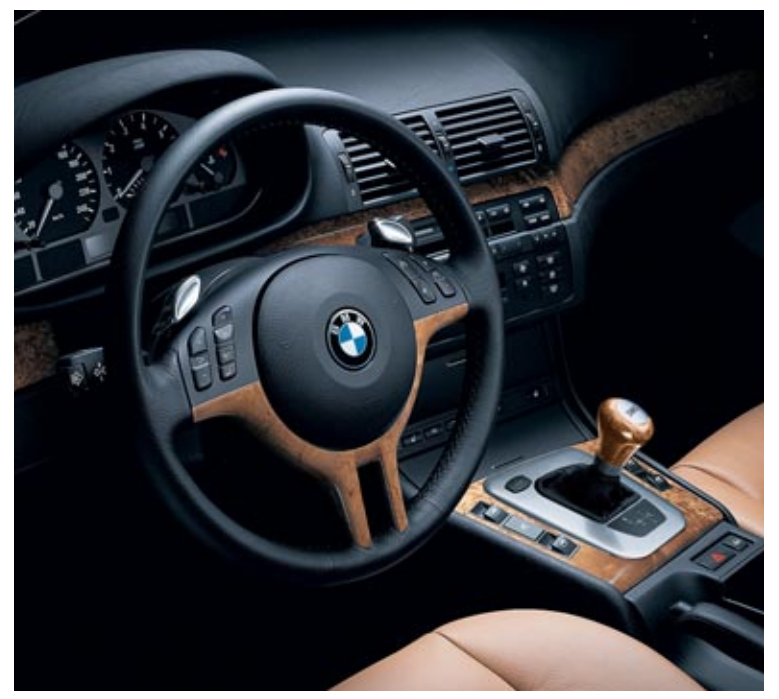
A four-spoke leather-wrapped multi-function steering wheel lets you keep both hands on the wheel while adjusting audio settings, available cruise control, and the accessory phone. (optional on-board navigation system shown)