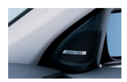
The Harman Kardon audio system features 12 upgraded speakers, upgraded amplification, and vehicle-speed-sensitive equalization. (Optional on 325i/xi and Standard on 330i/xi)