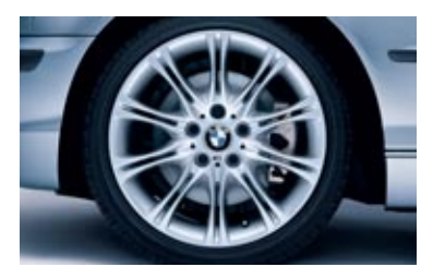
BMW light-alloy wheels (Styling 135M) double-spoke styling 135M with mixed tyres, 8 J x 18-inch, 225/40 R 18 tyres at front, 8.5 J x 18-inch, 255/35 R 18 tyres at rear (incl. with Optional 330i Performance Package)

<sup>1</sup>Due to low-profile tires, please note: wheels, tires and suspension parts are more susceptible to road hazard and consequential damages.