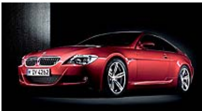
The new BMW M6 – immediately recognizable as a member of the high-performing M family.

The new BMW M6 is the new M flagship. Adding state-of-the-art sophistication to the growing segment of exclusive high-performance sport coupes, the M6 is a thoroughbred, top-class sports coupe that effortlessly combines the driving performance of a racecar with the comfort and convenience of an elegant luxury coupe. Its deliberately athletic, has innovative technologies and features a unique 500 hp, five-liter V10 high-performance engine. The new M6 will undoubtedly set new standards and take a leading position over direct competitors (i.e. Mercedes CL55 AMG, the Porsche 911 Turbo and the Ferrari Scaglietti) in its segment.