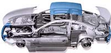
Carbon-fibre-reinforcements (marked blue) is used in the roof and bumpers.