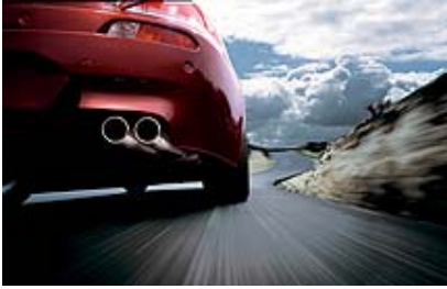
The new BMW M6 – combining superior driving performance with the type of handling that has traditionally been restricted to dedicated sports cars.