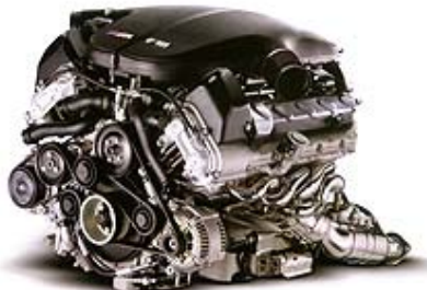
The unique V10 high-revving engine in the new BMW M6 has a five-liter capacity and delivers 500 bhp.