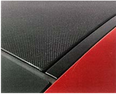
The carbon-fibre-reinforced (CFR) roof considerably lowers the weight of the vehicle and improves agility.