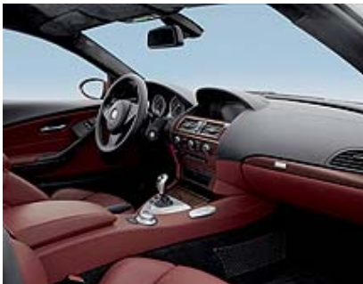
The cockpit of the new BMW M6 is tailored to the needs of the sports car enthusiast.