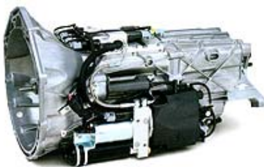
The sequential M gearbox with Drivelogic boasts seven gears and ensures optimum power transmission in the BMW M6.